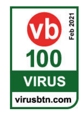
100%+ Wildlist Detection Rate