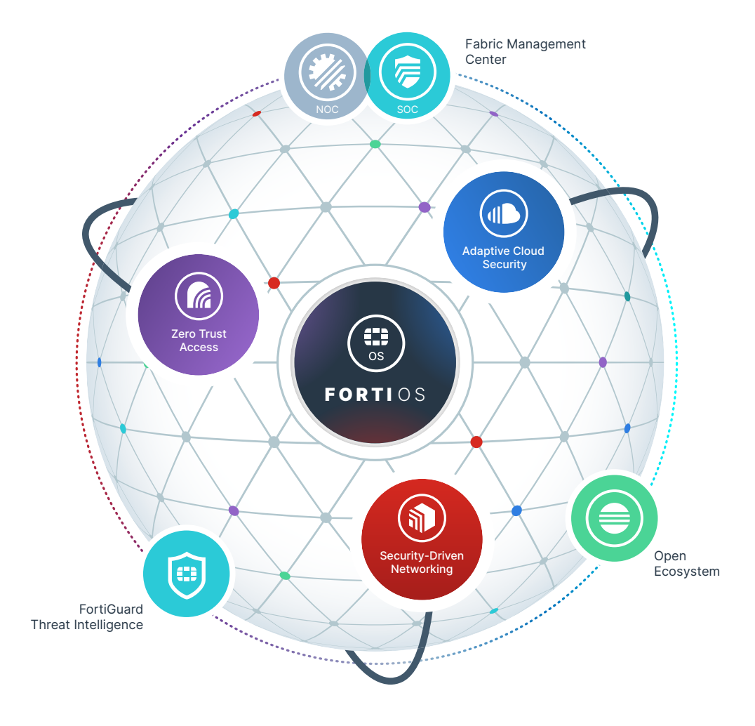
Figure 4: The Fortinet Security Fabric Architecture

As a foundational part of the Fortinet Security Fabric, FortiGate NGFWs deliver protection that keeps pace with the accelerating demands of high-performance enterprise networking. FortiGate NGFWs feature a purpose-built security processor technology, which provides extremely high throughput and exceptionally low latency while delivering industry-leading security effectiveness and consolidation.