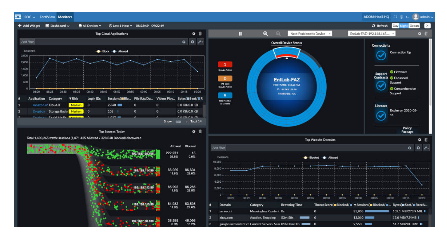
Figure 3: FortiManager dashboard view.

The unique single-platform approach of the Fortinet NGFW, which includes flexible deployment options, delivers end-to-end protection that is easy to buy, deploy, and manage. Centralized security management and visibility consolidates multiple management consoles into a single pane of glass and unlocks automation-driven management. Specifically, a highly intuitive view of applications, users, devices, threats, cloud service usage,` and deep inspection gives network engineering and operations leaders a better sense of what is happening on their network. With this strategic view, they can easily create and manage more granular policies designed to optimize security and network resources.