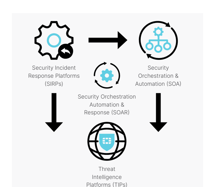
Figure 1: SOAR is the convergence of three key technologies that are necessary for timely threat identification and mitigation.