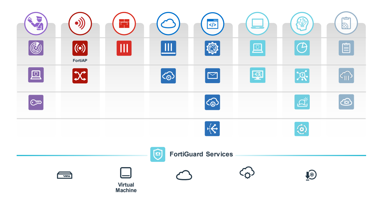
Figure 3: Key offerings in each of the Security Fabric solution areas.