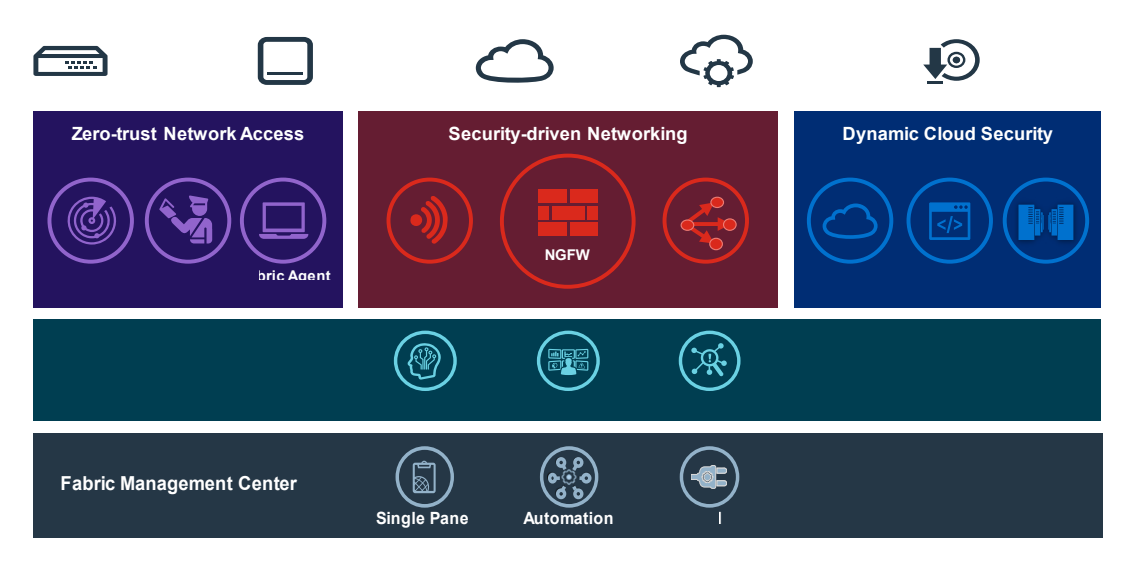
Figure 2: Conceptual framework for the Fortinet Security Fabric.